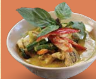
Green Curry Chicken GF 🌶️