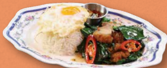
Ka Na Moo Grob Fried Egg