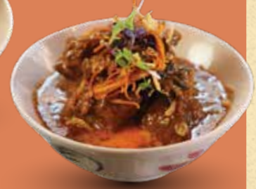
Massamun Beef GF