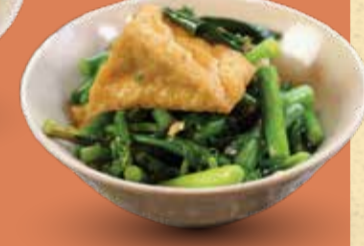
Stir-Fried Asian Green VE