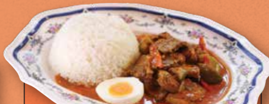
Panang Curry Beef Half Boiled Egg GF 🌶️