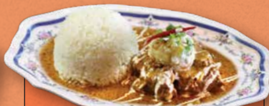
Massamun Beef Curry GF