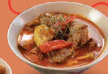
Panang Curry Beef GF 🌶️