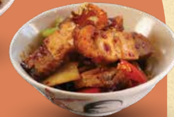
Stir-Fried Chilli Jam Crispy Pork