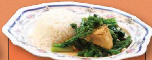
Stir-Fried Asian Green VE