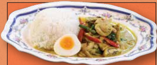
Green Curry Chicken Half Boiled Egg GF 🌶️