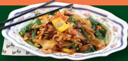
Cashew Nut Noodle