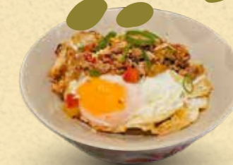
Fried Egg with Pork Minced & Tomato Sauce