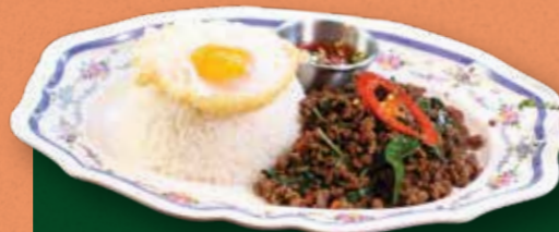
Basil Wagyu Beef Minced Fried Egg 🌶️