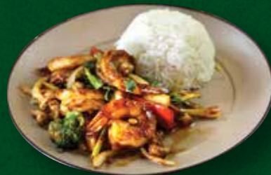
Cashew Nut Sauce