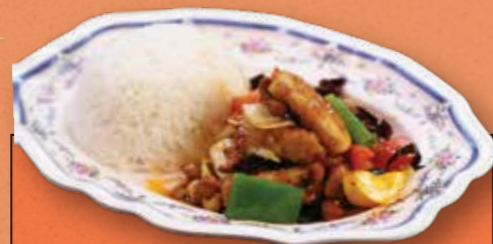
Cashew Nut Crispy Chicken