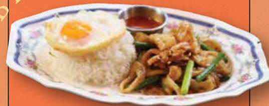
Garlic & Pepper Squid Fried Egg