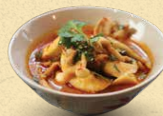
Tom yum chicken Soup 🌶️