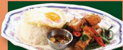
Basil Crispy Pork Fried Egg 🌶️