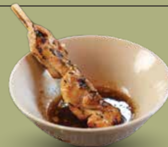
Chicken Skewer (1 Skewer)