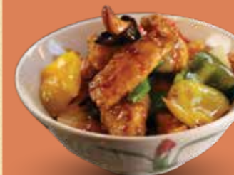
Cashew Nut Crispy Chicken