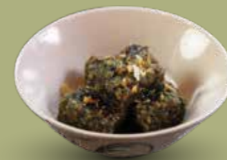
Garlic Chive GF V