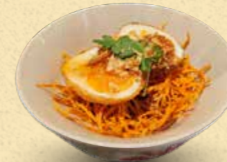
Son in Law Egg GF