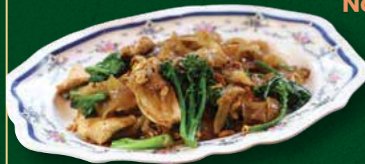
Pad See Ew