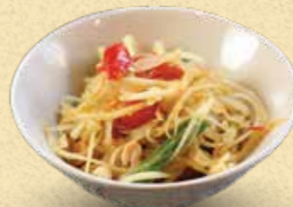
Papaya Salad GF 🥥