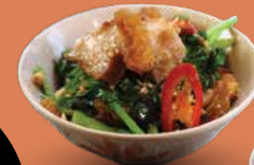
Ka Na Moo Grob