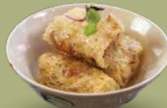
Prawn Crab Spring Roll (3 Pcs)