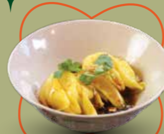
Steam Dumpling (2 Pcs)